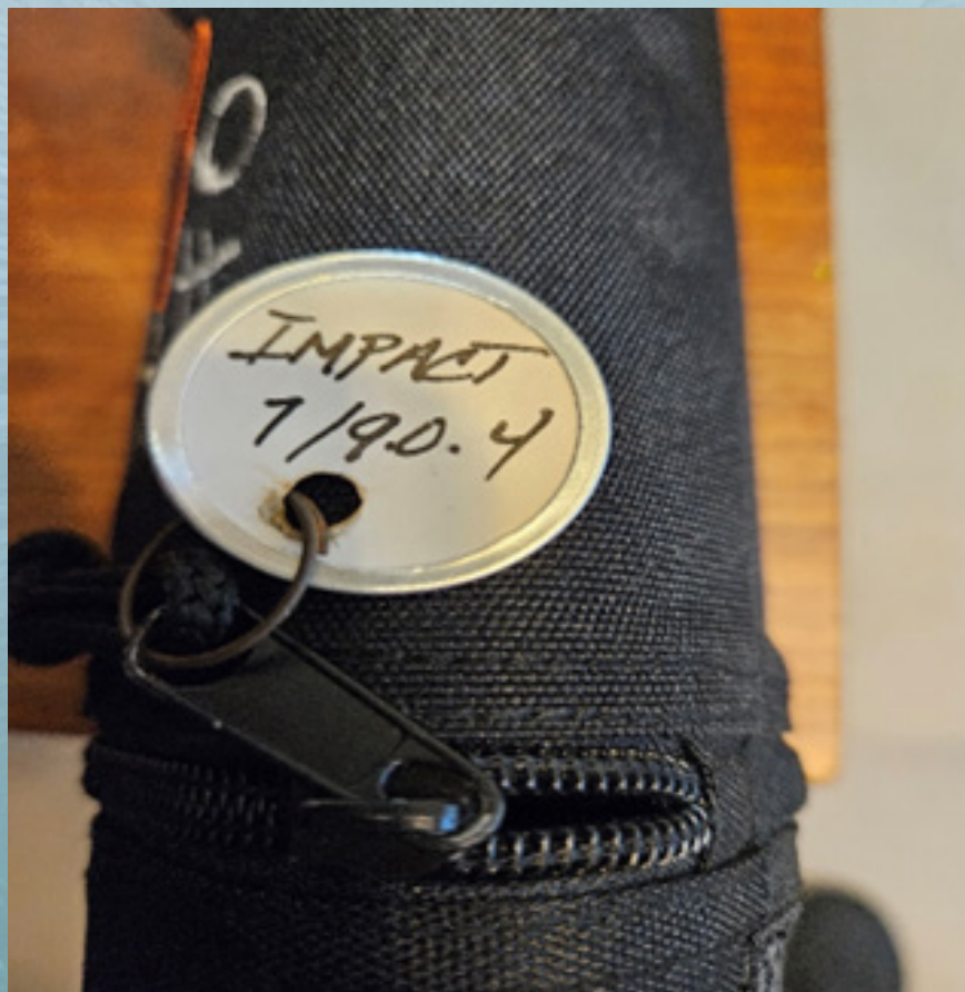
Figure 4, Key Tag Identificaton

Rod Tube Identification: Some might say I have too many fly rods, but I disagree. I am always looking for the next flyrod. Having all the fly rods in tubes standing in the corner of my office I have found an easy way to keep track of which rods are in what tubes. By using "Key Tags" the tubes easily identified what rods are in the tube. (see figure 4)