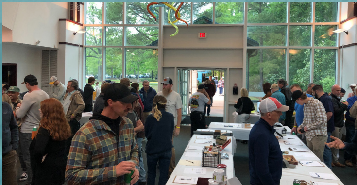
FLY FISHING FILM TOUR - APRIL 19, 2024