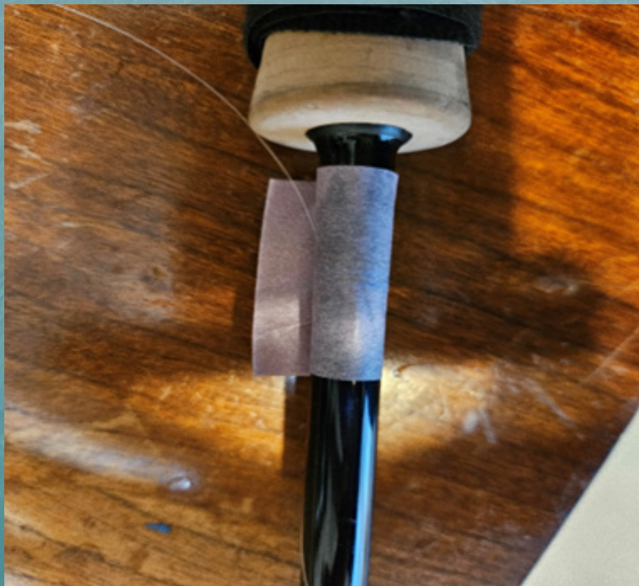
Figure 3, Painters Tape and Tippet

After threading the leader/tippet and running line through each line guide, I would bring the tippet end to the reel seat area and again use a small piece of painter tape keeping the Mono/Flor line in easy reach and ready to tie the fly. (see figure 3)