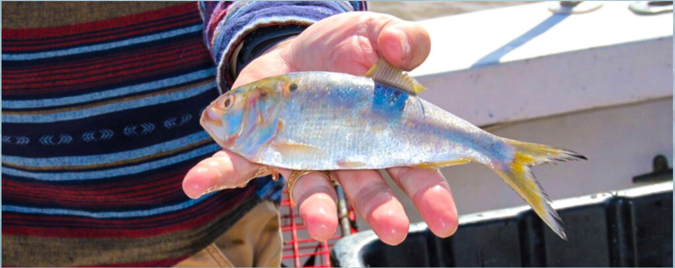
A menhaden pulled from the Chesapeake Bay in the area of Jordan Point Marina.

Another attempt to impose tighter regulations on the menhaden fishery in Virginia was defeated Tuesday and interested parties again called for the state to study the menhaden population. This story was reported and written by our media partner The Virginia Mercury