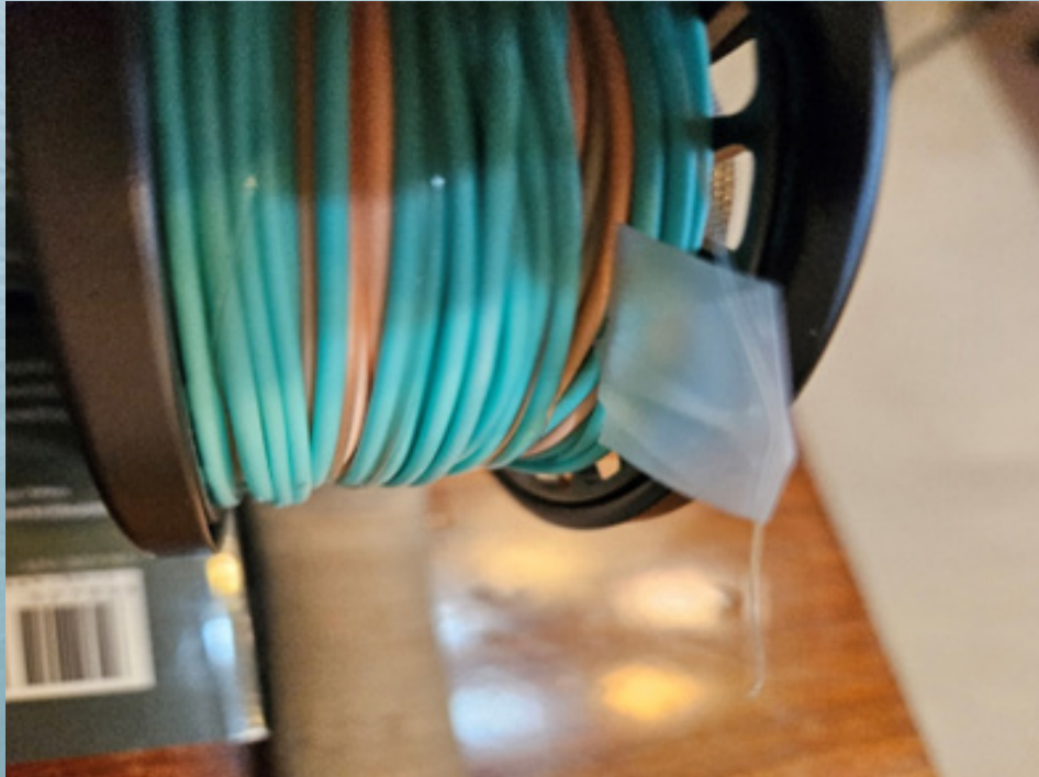
Figure 2, Scotch Tape and Tippet

Tippet End: I us to find myself looking for the invisible end of the tippet that was entangled with the fly line on the reel. Sometimes I begin to pull the tippet end only to find out the leader/tippet was intertwined with the first few feet of the fly line. Now I place a small piece of Scotch Tape over the end of the tippet preventing the tippet from entangling with the running line. (see figure 2)