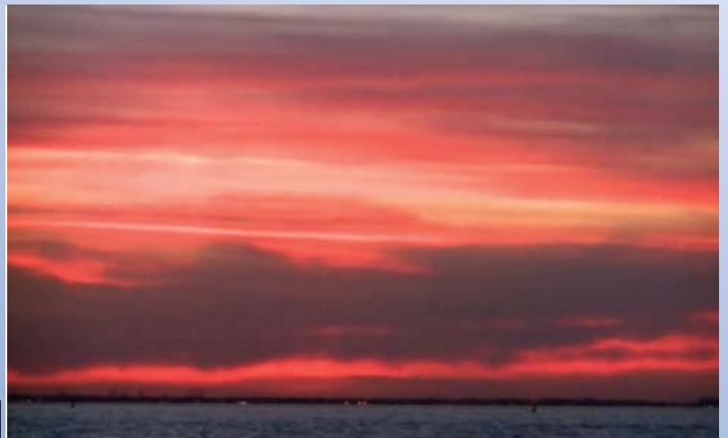
RED SKY AT NIGHT - NOVEMBER 26, 2011